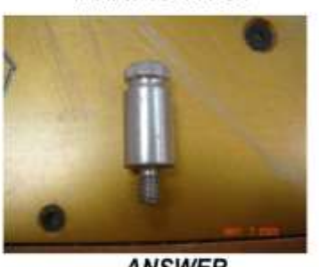
ANSWER STARTER PIN

When routing an irregular shaped workpiece with a piloted bit on a router table, always use a Starter Pin to help you ease your work-piece into the rotating bit without snagging