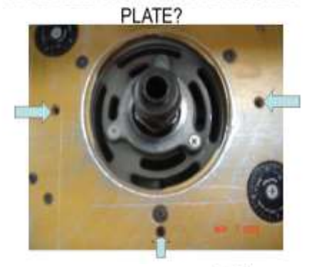
WHAT IS THIS?